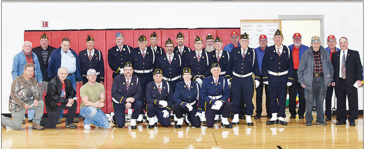
Top photo: Cumberland American Legion Post 98 Honor Guard and Cumberland VFW Advance The Colors at the Veterans Day Program held at Cumberland High School Friday November 11th. A heartfelt THANK YOU to all who served our great country. Bottom photo: Veterans in attendance gathered for a photo after the program