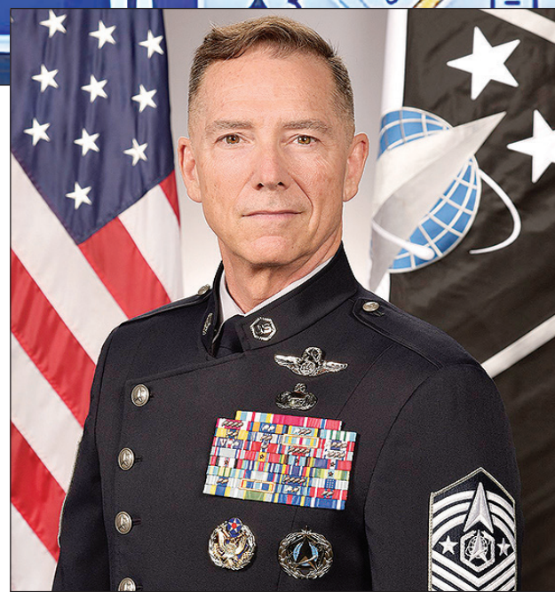
Chief Master Sergeant Roger Towberman