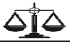
EXHIBIT C NOTICE OF REFERENDUM CUMBERLAND SCHOOL DISTRICT FEBRUARY 20, 2024